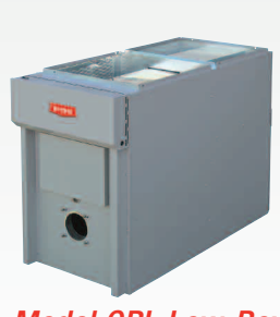
Model OBL Low-Boy

installations, the Low-Boy models are perfect for homeowners whose space is at a premium.