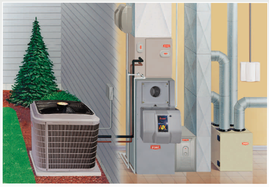
Air Conditioner and Oil Furnace System