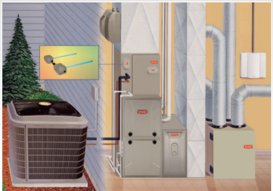
Air Conditioner and Gas Furnace System