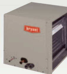
Model CNPHP Horizontal Cased N-coil