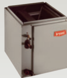
Model CNPVP Vertical Cased N-coil