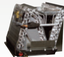
Model CNPVU Vertical Uncased N-coil