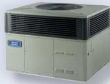
Platinum 16 Heat Pump

The ultimate in comfort is also the ultimate in efficiency. With a variable-speed motor, Comfort-R™ technology and a wide array of other innovative features, products in our Platinum Series enhances humidity control, eliminate temperature variances and increase energy savings.