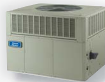
Silver 14 Gas/Electric