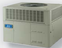
Silver 14 Air Conditioner Silver 14 Heat Pump

Not only does the American Standard Silver Series exceed all standard efficiency requirements, it will also exceed your expectations. With the Silver Series' high quality and craftsmanship, you get the energy efficiency you want and the ruggedness and durability you need.