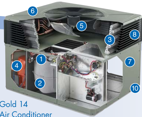
Gold 14 Air Conditioner