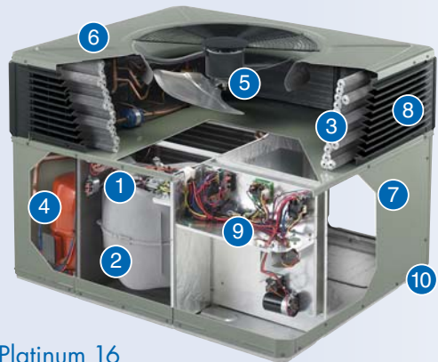
Platinum 16 Heat Pump