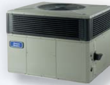
Platinum 16 Gas/Electric Platinum 16 Hybrid