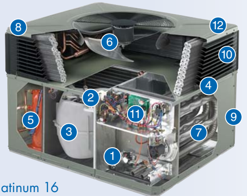
Platinum 16 Gas/Electric System