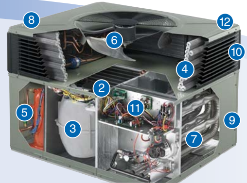
Platinum 16 Hybrid System