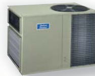
Silver Heat Pump American Standard 4WHC