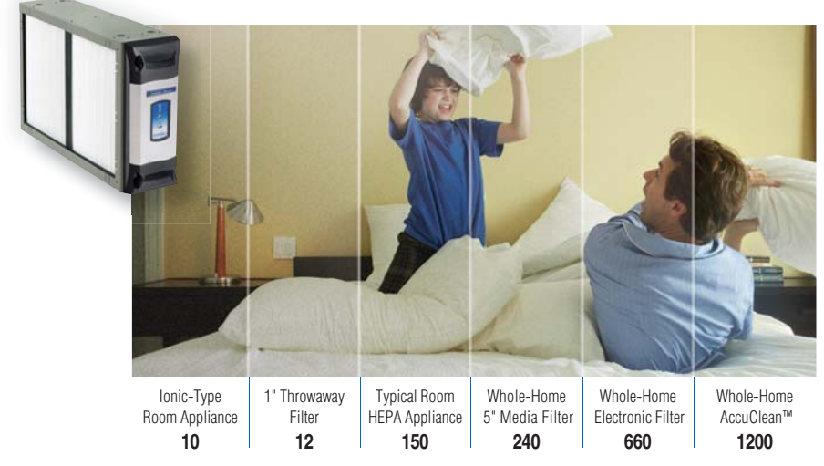
Ratings of cubic feet per minute of clean air delivered for a typical 3-ton heating and cooling system: the higher the value, the more effective the air cleaner.

Want 99.98% clean air? Then choose the home air filtration system that delivers – American Standard's revolutionary AccuClean.™ By removing up to 99.98% of unwanted allergens down to .1 micron from the filtered air, AccuClean is 100 times more effective than a standard 1" throwaway filter. Simply put, AccuClean works harder, so you and your family can breath easier.